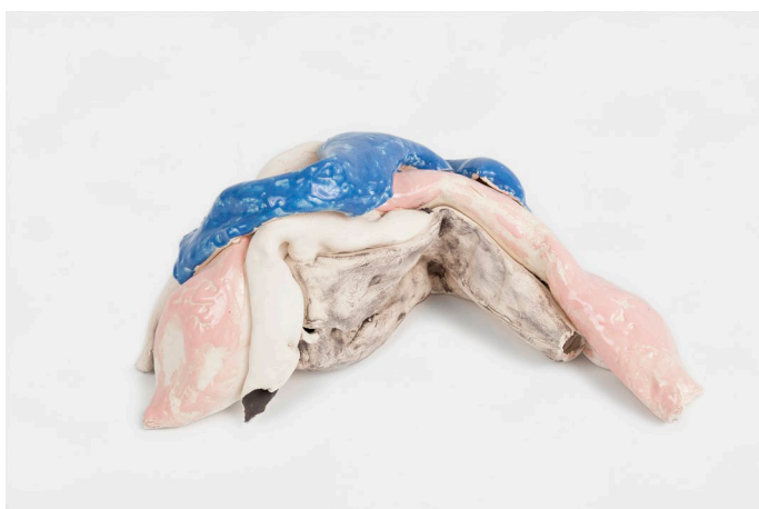
Laura im BBK , 2017, ceramic, glazed with Laura Pankau, 18 x 41 x 27 cm