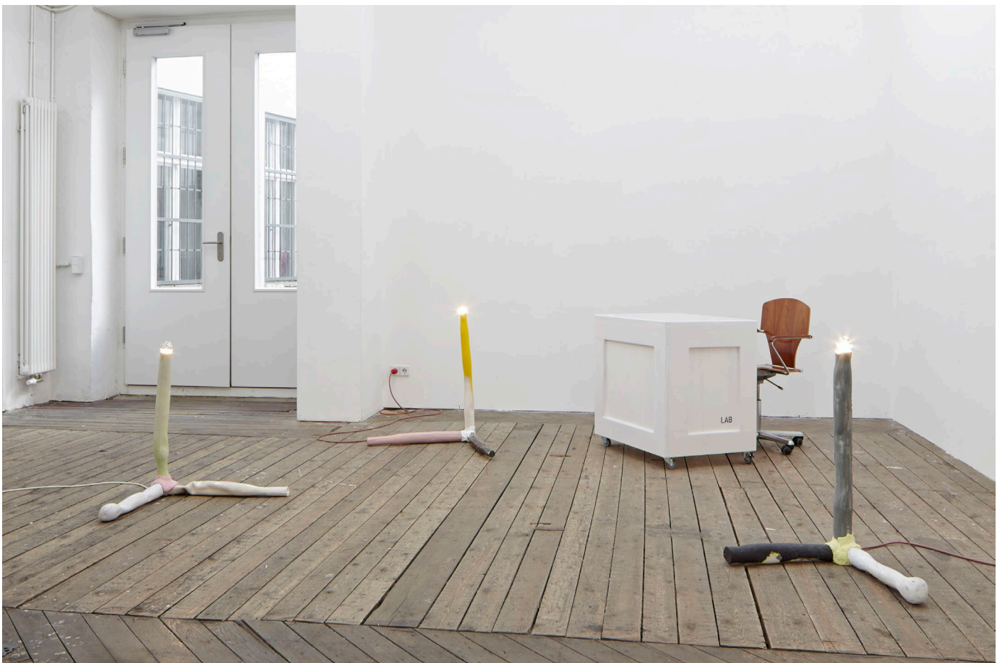
Exhibition view, Die Putze, 2017