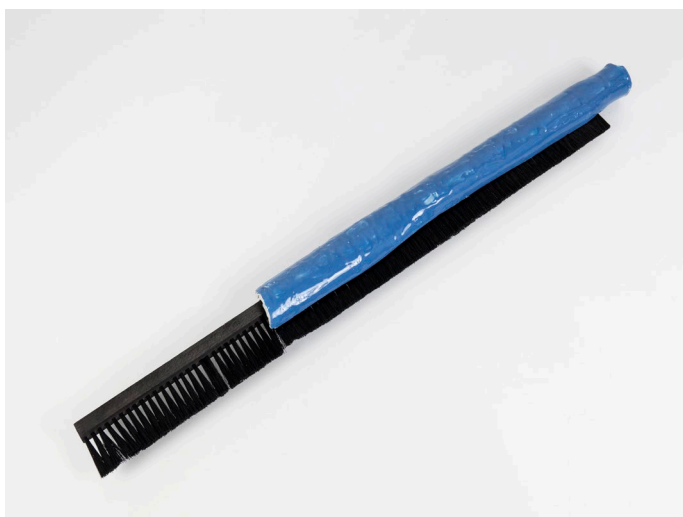
Blauer Besen , 2017, glazed ceramic, brush, 7,5 x 106,5 x 10 cm