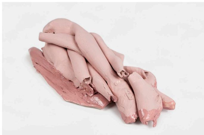
Laura im BBK 2 , 2017, ceramic, glazed with Laura Pankau, 17,5 x 64 x 25 cm