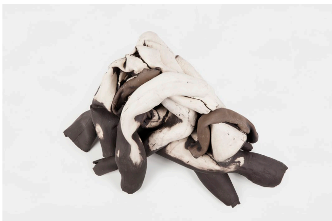
die Putze , 2017, ceramic, glazed together with Laura Pankau, 36,5 x 66 x 60 cm